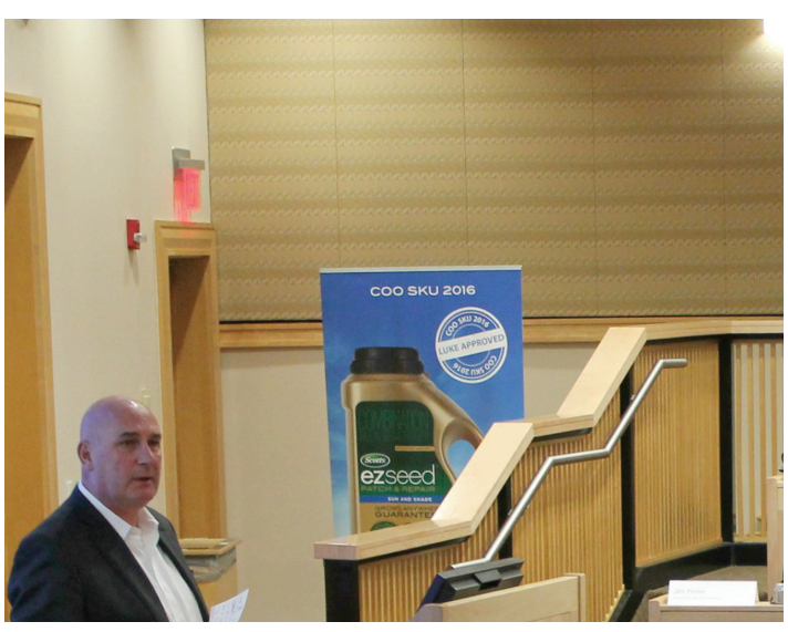
Hugh Grant, Chairman and Chief Executive Officer, Monsanto Company.

With regard to efficient delivery of water, there are significant opportunities not only around installation of pivots and irrigation systems, but also in the development of new materials that improve efficiency. A smart membrane that senses soil moisture levels and releases water only when needed, for example, would be much more beneficial than a pressurized system that can break, overwater or use excessive amounts of energy. These materials are not science fiction—they already exist, but come at relatively high costs versus traditional irrigation methods.<sup>18</sup>