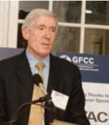
Robert D. Hormats, Under Secretary of State for Economics, Business, and Agricultural Affairs, U.S. Department of State

The Council on Competitiveness is leveraging its strong presence in the international community to broaden its understanding of how key trading partners are addressing global competitiveness strategy. In 2010, the Council became a founding member of the Global Federation of Competitiveness Councils (GFCC), the first international organization to focus exclusively on competitiveness policies. The mission of the GFCC is to create a global network of competitiveness councils to exchange information on best practices and create new metrics to benchmark international competitiveness.