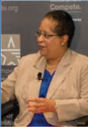
Shirley Ann Jackson, University Vice Chair, Council on Competitiveness, President, Rensselaer Polytechnic Institute