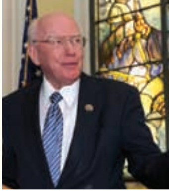
Former Representative Vernon J. Ehlers (R-Mich.)

The Council also honored retired Chairman Bart J. Gordon, of the House Science and Technology Committee, and retired Congressman Vernon J. Ehlers for their impact on America's ability to keep its competitive edge in the global marketplace.