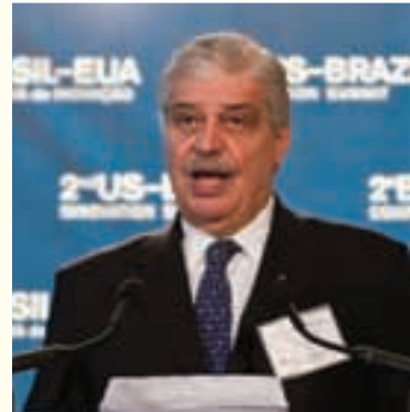
Miguel Jorge, Minister of Development, Industry and Trade, Government of Brazil

The breakthroughs of the first Innovation Learning Laboratory series are captured in the Council's comprehensive Catalyze report, which details the participants, agenda and insights from each multi-day Innovation Learning Laboratory.