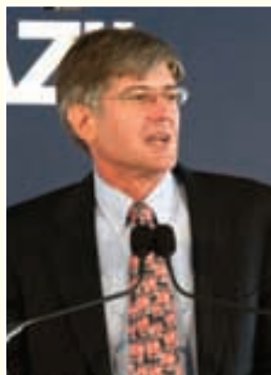
James B. Steinberg, Deputy Secretary of State, U.S. Department of State