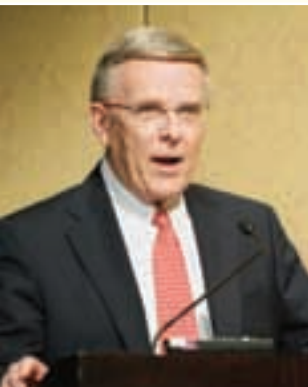
Former Senator Byron L. Dorgan (D-N.D.)