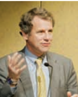
Senator Sherrod Brown (D-Ohio)