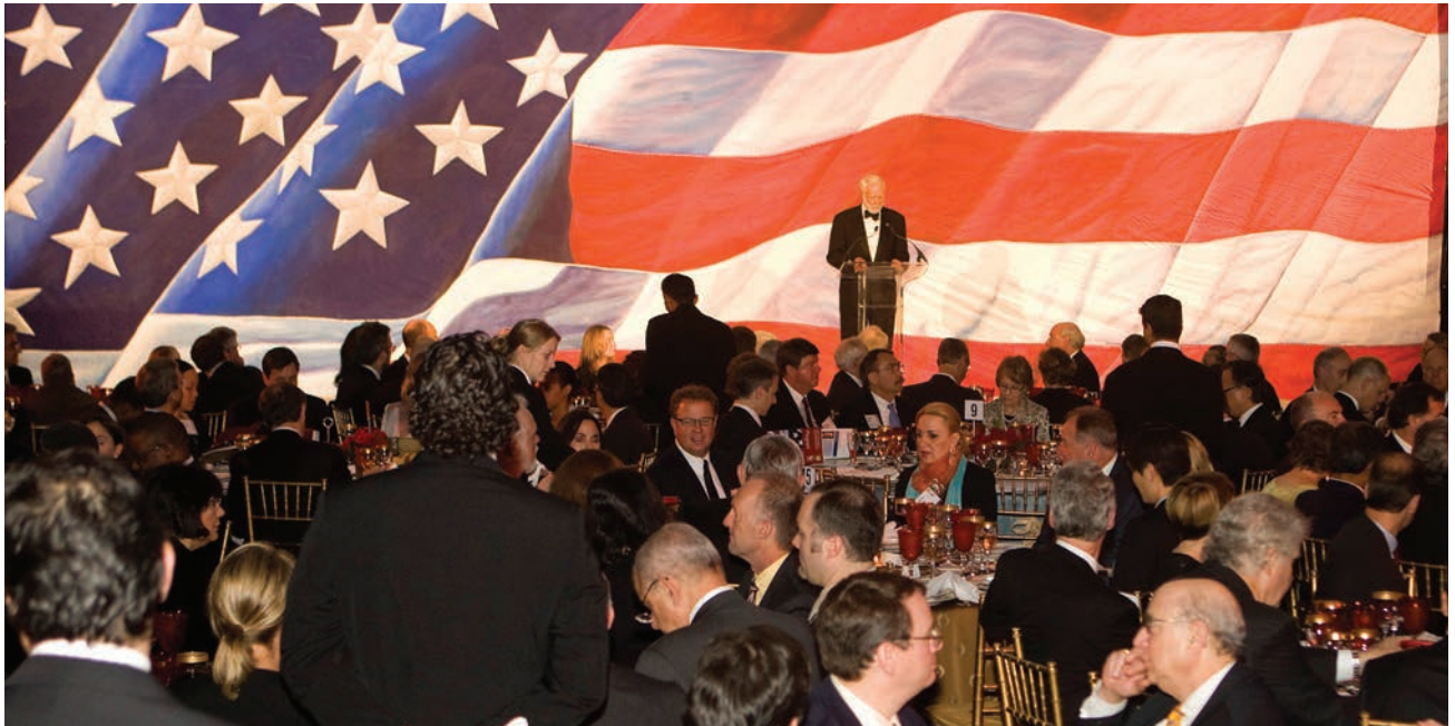
The Council on Competitiveness celebrated its 25th anniversary with a gala dinner in Washington, D.C., on December 7, 2011.

For the past 25 years, the Council on Competitiveness has framed the national and global conversation around one of the most critical issues of our time: how to create the conditions for sustainable productivity growth at the heart of national prosperity.