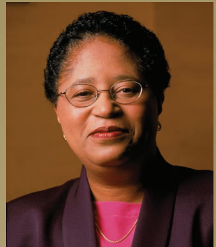
Shirley Ann Jackson President Rensselaer Polytechnic Institute