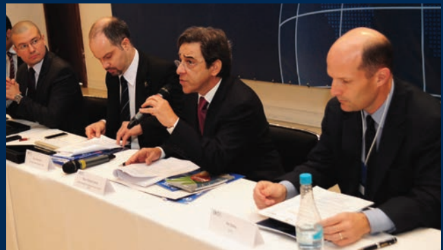
Top: On November 21-22, 2011, the GFCC co-hosted along with the 2011 vice-chairs—the Brazilian Agency for Industrial Development (ABDI) and Brazilian Competitiveness Movement. (MBC)—the Competitiveness Forum and 2011 Annual Meeting in Porto Alegre, Brazil.