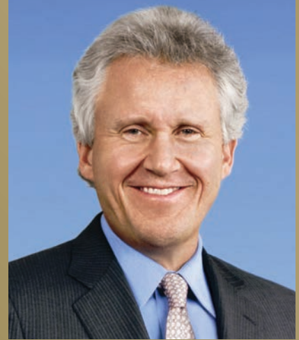
Jeffrey R. Immelt Chairman and CEO General Electric Company

Both of these awards highlight commitment to excellence and the American spirit. More than 50 sponsors supported this milestone event, including Deere & Company, Lockheed Martin Corporation, JPMorgan Chase, General Electric Company, Deloitte, and Cisco. The Council plans to host a series of America Competes Awards ceremonies around the United States.