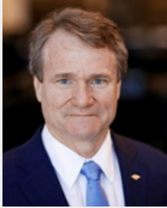
Brian Moynihan , CEO & Chairman, Bank of America

"The Council has a real opportunity to grow, share its message, and engage many more Americans in our movement to boost long-term innovation, sustainability and resilience."