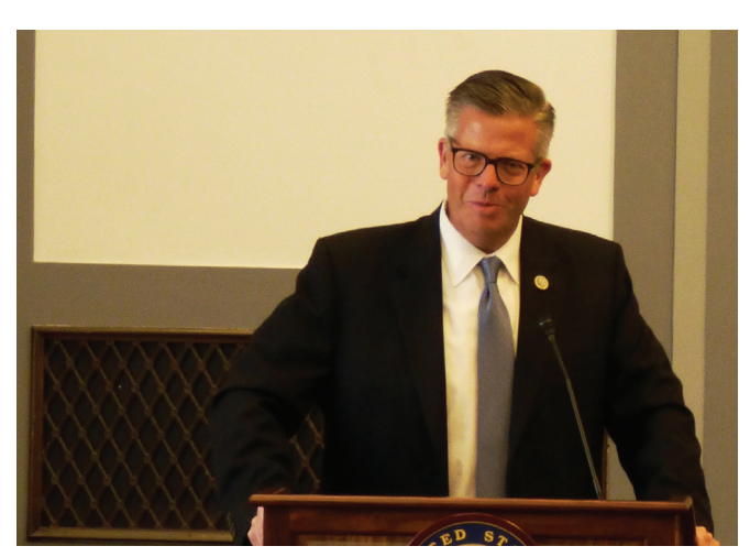
The Honorable Randy Hultgren, United States Representative (R, IL-14) at the Hill briefing during which the Energy and Manufacturing Competitiveness Partnership report, Leverage: Advancing U.S. Bioscience, was released on July 25, 2017.

As much as 2017 represented a year of change, it also marked one of continuity as the Council continued to work with policymakers on new and existing efforts carried over from previous years. In 2017 the Council built upon its existing relationship with the Senate Competitiveness Caucus hosting a briefing on the critical role of biosciences in strengthening U.S. manufacturing. The briefing featured a keynote by Rep. Randy Hultgren (R, IL-15) and was attended by over one hundred congressional staffers representing Members of Congress from the House and Senate as well key committees, offering pathways to develop new relationships.