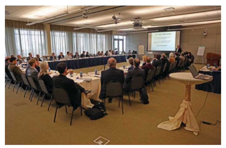
Participants at the Water and Manufacturing Sector Study Meeting at Marquette University Law School in Milwaukee, WI.

Far too often, little light is shed on the possibilities for water careers. There is an increasing effort to provide real, tactical solutions to this issue and increase the attractiveness of water careers for people of all ages from "k-through-gray." This requires the union of industry and education under three key drivers of talent: existing technologies, macro changes and new policies. The talent pool needed to advance this space must be carefully crafted through specific training and education that can be achieved through public-private partnerships. In addition to increasing technical skills, it is crucial to consider interdisciplinary studies when thinking of the education opportunities needed to create a stronger talent pool.